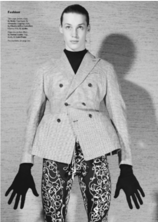
Fashion The long jacket, top, by Mads; top, skirt, by Christian Lacroix; shoes, by Christian Lacroix; jewelry, by Aurore; sunglasses, by Aurore; boots, by Aurore; shoes, by Aurore; shoes, by Aurore.